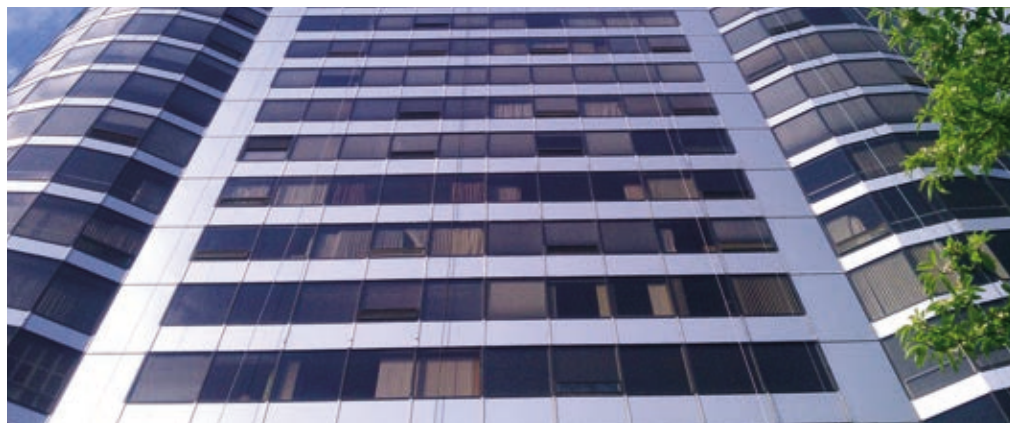
Portland Plaza, Portland, OR. Product: Aluminum Composite Material