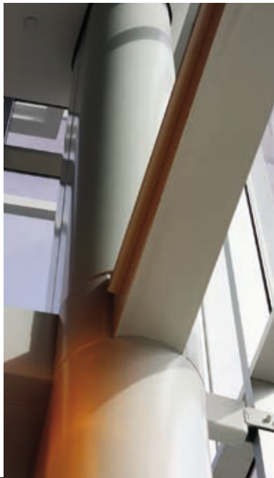
MGH Museum, Boston, MA Product: 0.125" aluminum column covers painted with Valspar's Fluoropon.