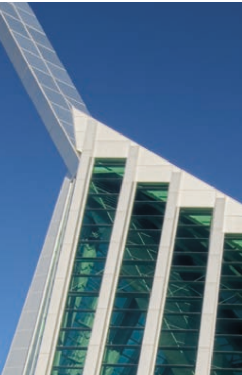
National Museum of the Marine Corps Product: SAF fabricated 11 gauge brushed stainless steel for the large protruding interior column.