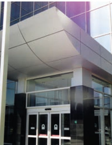
IBC Bank, Oklahoma City, OK Product: NM 500 panels