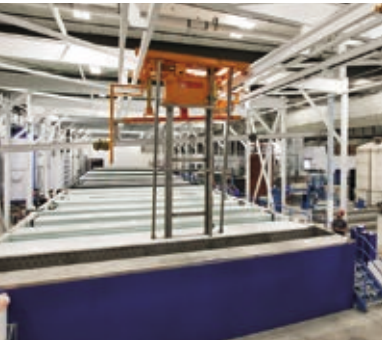
Fast, reliable delivery of anodized aluminum is made possible by the wide and deep inventory stored adjacent to SAF's anodizing lines.