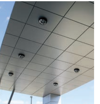
New Braunfels Rehabilitation Hospital Product: Series 4000 Rainscreen panels