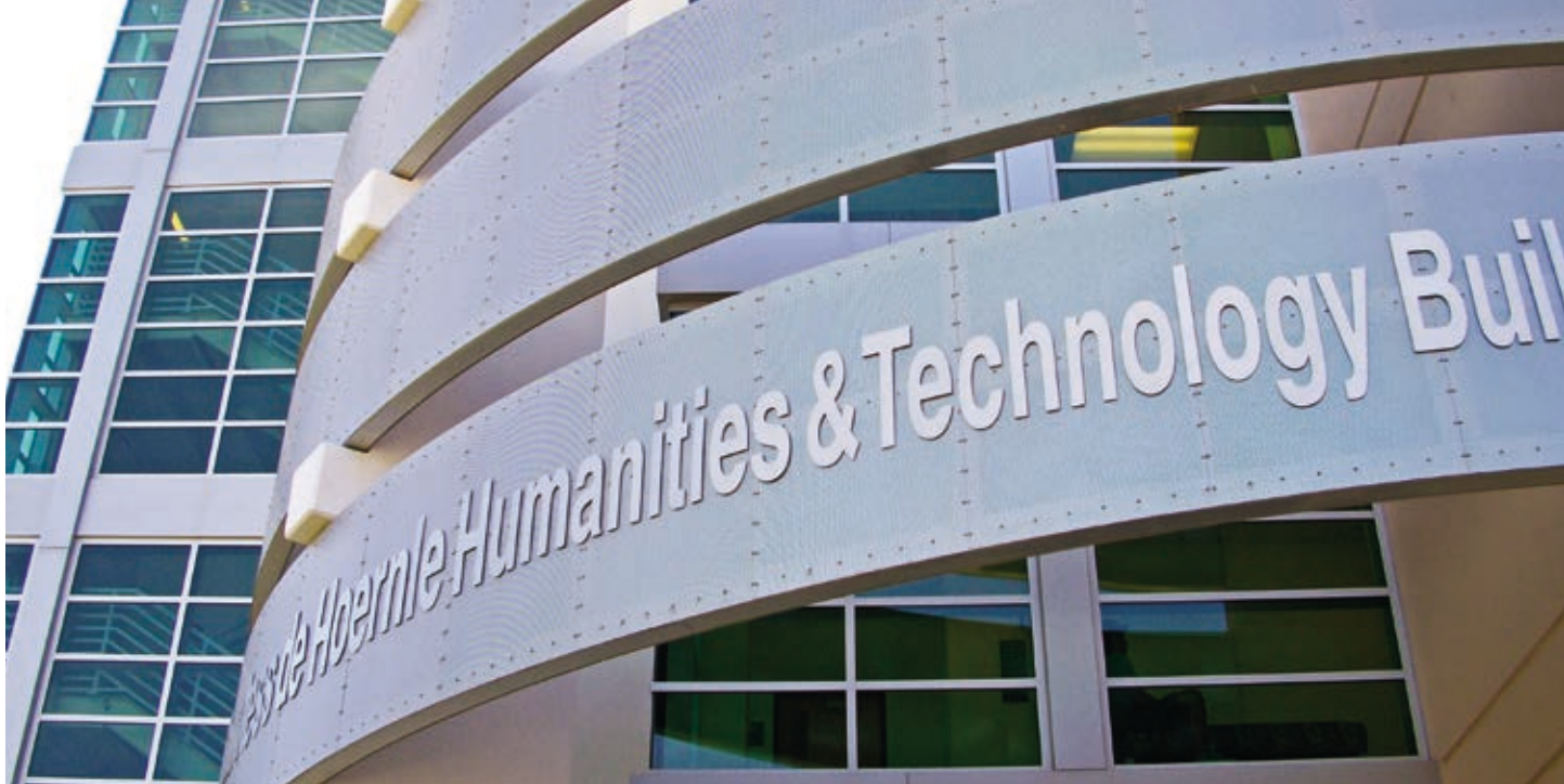
Palm Beach Community College Humanities & Technology Bldg. Product: 0.125 formed aluminum with a 204 clear anodized finish.