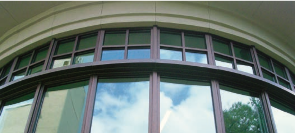
Oglethorpe Dining Commons Expansion Project, UGA, Athens, GA. Product: Medium Bronze anodized radiused panels

“We at Hager Companies have enjoyed a long-standing relationship with Southern Aluminum Finishing for our anodizing and painting needs. They provide us with all of the essential components of an effective value proposition: cost, quality, and true customer service. The associates of SAF are the true measure of our relationship. Their commitment to service, professionalism, and diligence has played a large part in making Hager successful.”